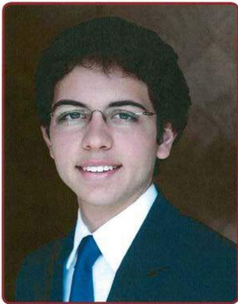
His Royal Highness Crown Prince Hussein Bin Abdullah II