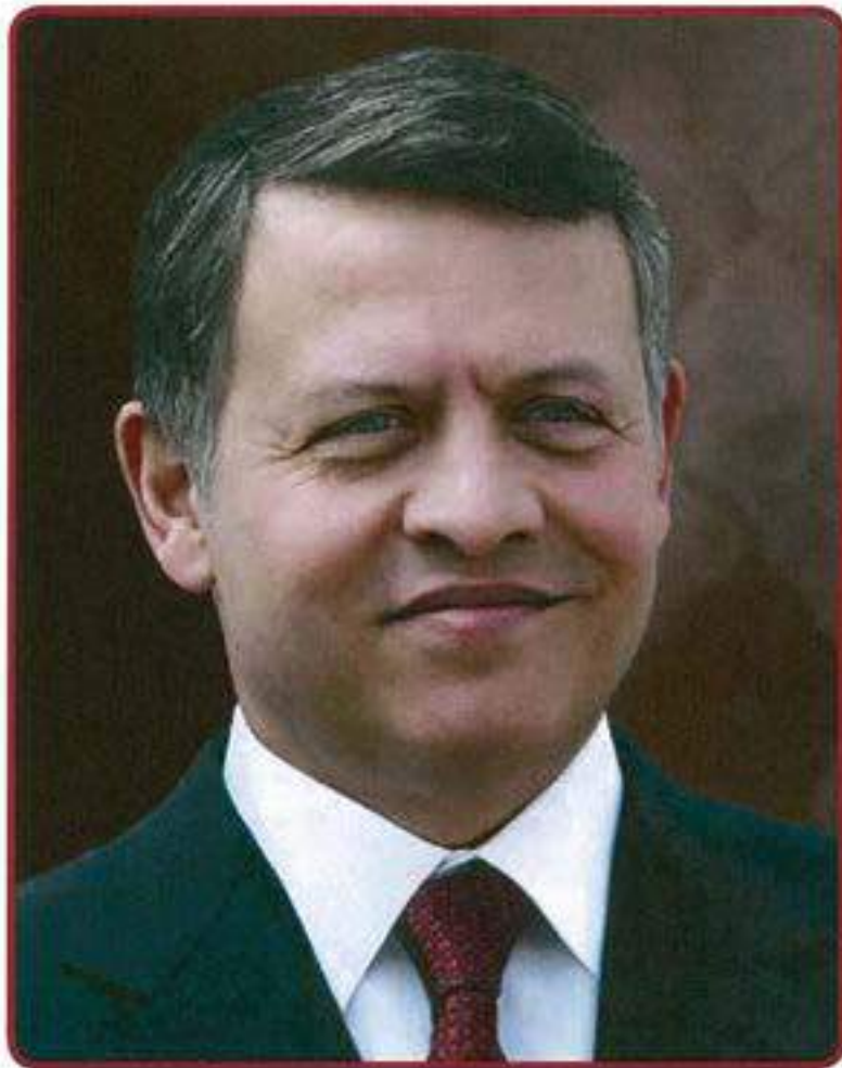
His Majesty King Abdullah II Bin Al Hussein